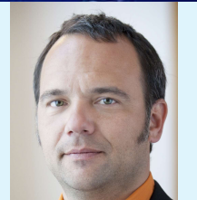
Thomas Schneider Swiss Federal Office of Communication & Council of Europe Committee on AI