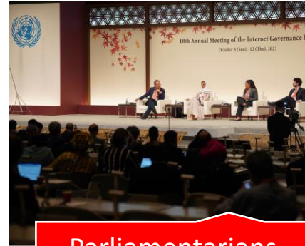
Parliamentarians and Judiciary