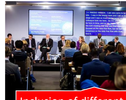
Inclusion of different groups