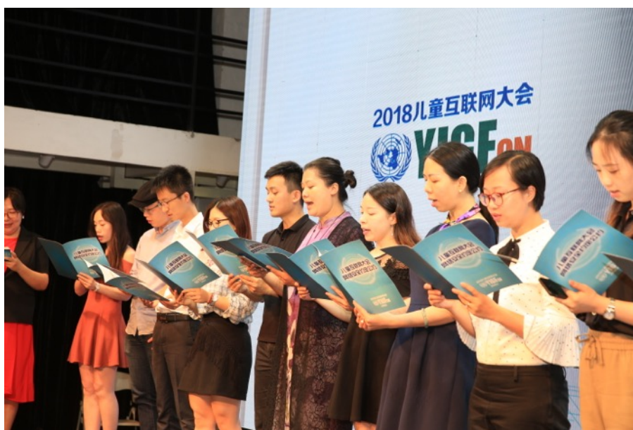
图片：来自腾讯、抖音等中国领先的网络科技企业代表在大会发布保障少年儿童网络安全的行业公约 Photo caption: Representatives from tech corporates including Tencent and Tik Tok announced their joint declaration on promoting child online safety during the forum

在大会上，聆听完儿童代表的报告，来自国内知名的互联网科技企业代表们，也表示要积极承担社会责任。为了保障广大少年儿童的网络安全，更好构建有利于少年儿童成长的清朗网络空间，参加儿童互联网大会的科技公司和相关单位共同发起公约，并倡议全行业联合行动。