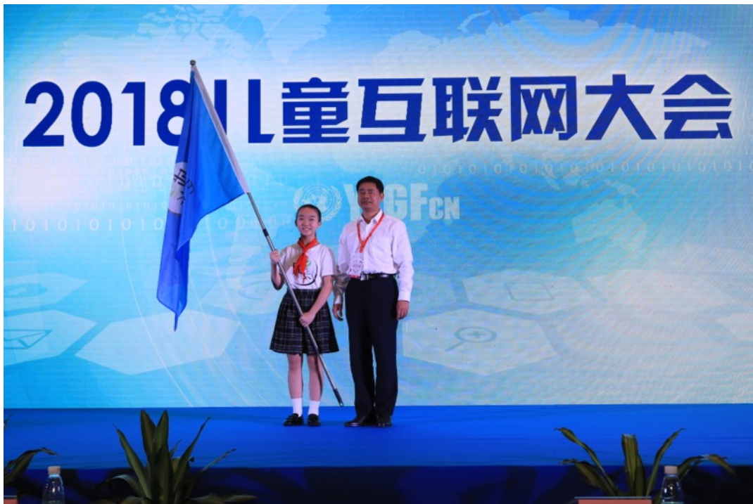
图片说明：有关领导为 E 成长公益小讲师支教队授旗 Photo Caption: Peer lecturers of the E-development scheme had been officially appointed

在儿童互联网大会上，还出现一批公益小讲师，他们关注的乡村小伙伴的网络安全教育。这些小讲师来自广州青少年发展基金会联合公益机构发起的“E 成长”公益计划。在网信部门指导下，近两年来，广州青少年发展基金会等带动少年宫，以及相关公益机构开展了“E 成长计划”乡村小学网络素养支教计划。该活动以“城乡儿童手拉手，约定齐做好网民”为主题，招募培训儿童小讲师组成支教小组，到乡村学校传播分享网络安全和素养知识。跟随前往的专业志愿导师，还会为乡村小学的教师和家长进行讲座和培训。目前支教小分队已经到广东清远、湛江、恩平，以及贵州、四川、广西等多地进行了十多场次的支教活动，上万人次的乡村儿童受益。