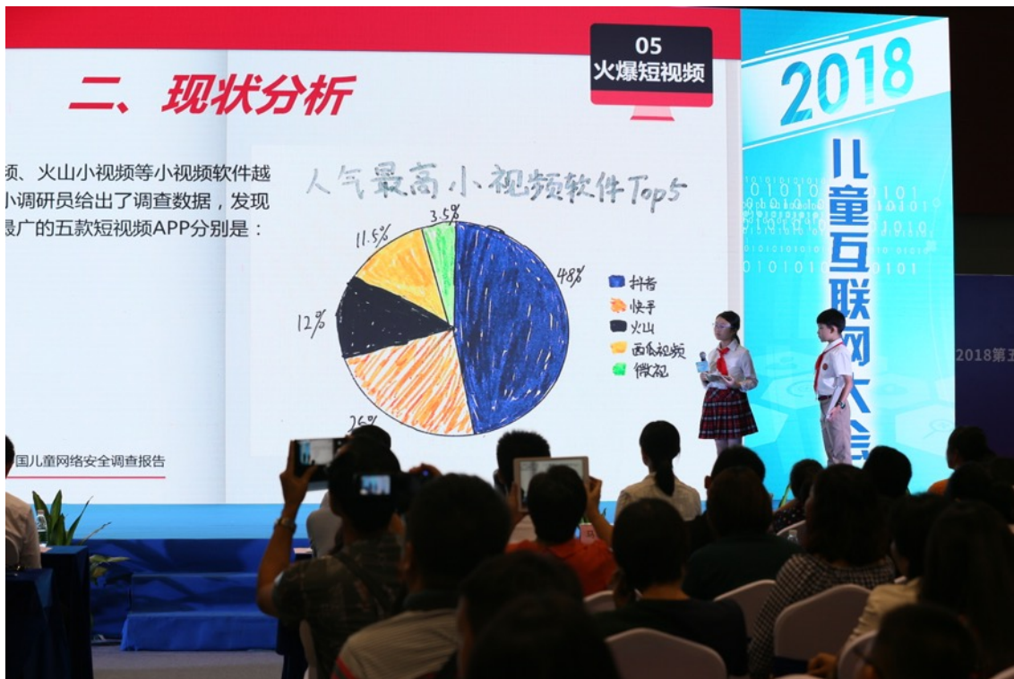
图片说明：来自全国 10 城市的儿童代表，正式发布了中国首份由儿童代表自己编制完成的《2018 中国儿童网络安全调查报告》