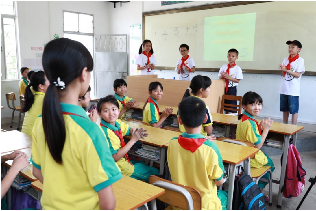
图片说明：E 成长公益小讲师到农村支教，将网络知识分享给乡村小伙伴 Photo Caption: Peer lecturers of E-Development Scheme visit the village in remote area, sharing the knowledge of media literacy with other students

在会上，领导为 E 成长小讲师代表授旗，以鼓励他们继续坚持这种善举，并带动身边的小伙伴加入到这支队伍中去。