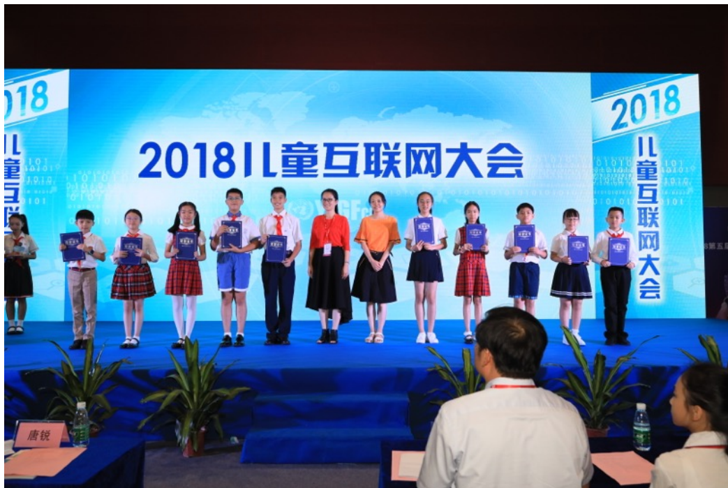
图片说明：有关领导为儿童互联网小使者 CRO 颁发证书 Photo caption: Child Internet Ambassador CRO received the certificates on the stage

在大会上，儿童调研员中的一批优秀代表，还被授予了儿童互联网小使者（CRO）的光荣称号。这些小 CRO 们可不简单呢，他们作为中国“儿童互联网小使者”带着这些调查报告，去到世界各地举办的联合国网络管制论坛以及各种儿童会议上，代表中国儿童发声。